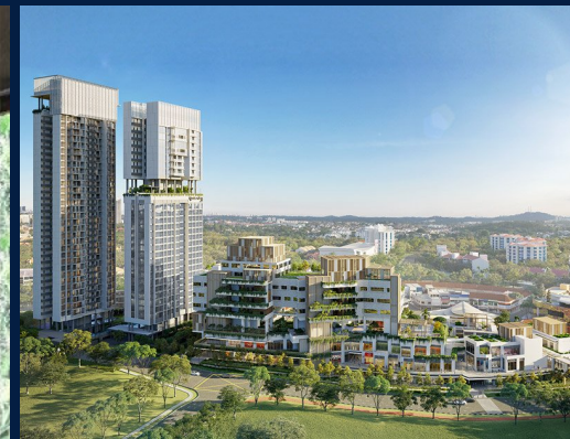
Quincy : 4 - Bedroom + Study Duplex