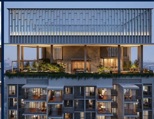
Leven : 2 - Bedroom Duplex